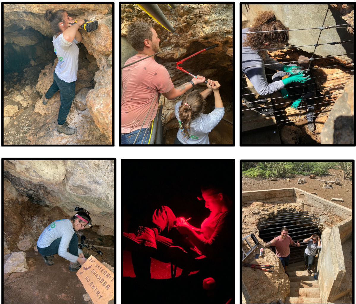
Figure 2. Different aspects of the installation of the physical barrier and the data collection at the bat maternity cave Pos di Antoin.

During 2020, the last monthly bat capturing session of the 2019-20 year-cycle for data collection at the maternity cave Pos di Antoin was successfully completed in February. This data was included in a 12-year dataset of 13 bat maternity roosts in the ABC islands and a manuscript was submitted for publication in a scientific journal.