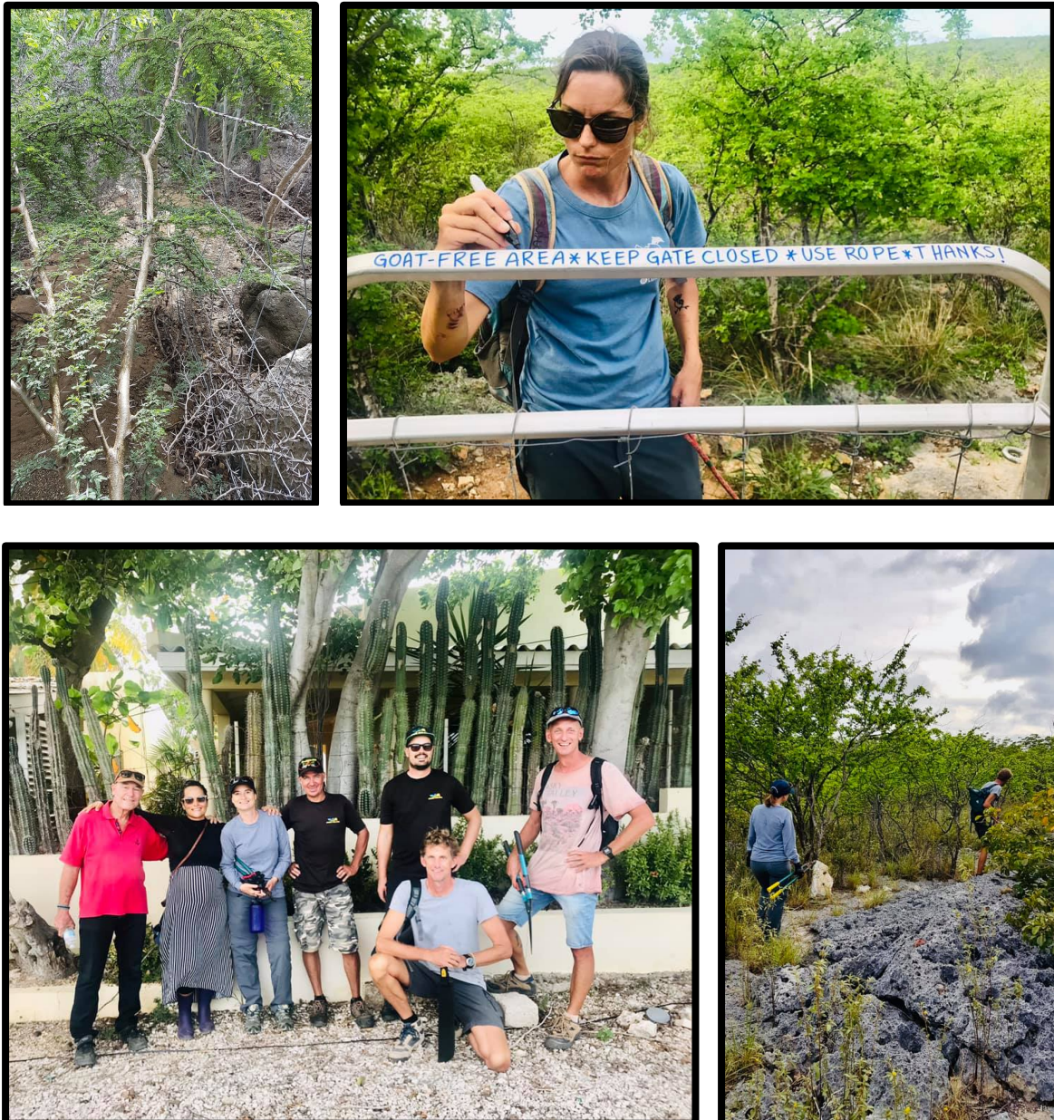
Figure 3. Activities during the cleanups and maintenance activities at the Bonaire Caves & Karst Park initiated by the ETR group.

During 2020, the ETR working group also initiated an education project aimed to Group 8 students of the primary schools. The first school that will receive the program at the beginning of 2021 is Pelikaan School. In agreement with the school Director, group 8 will be split up in 2 halves and students taken in educative morning cave tours.